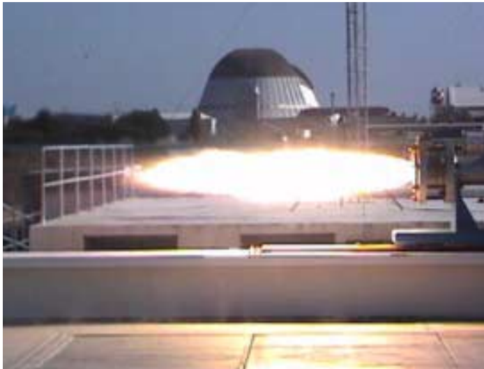
Above: That's no candle flame! This is a test of paraffin-based fuel at NASA Ames.

AMERICAN INSTITUTE OF AERONAUTICS AND ASTRONAUTICS SAN FRANCISCO SECTION P.O. BOX 1548, MOUNTAIN VIEW, CA 94042 http://www.aiaa-sf.org