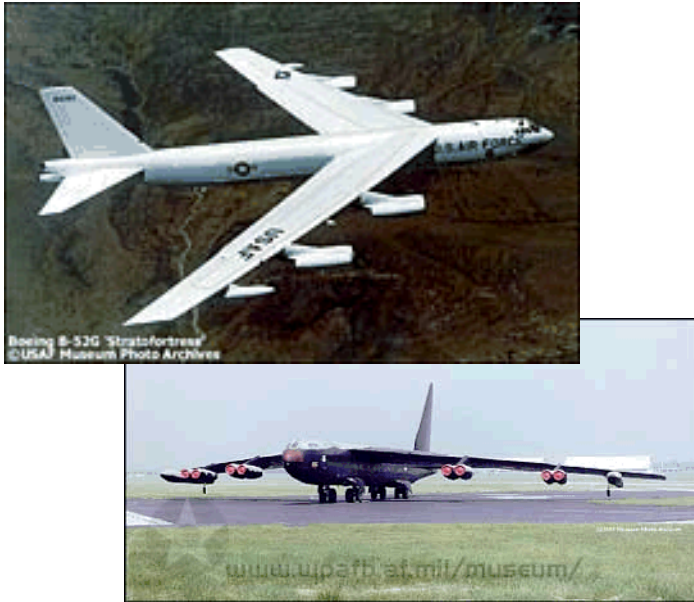
Top: Boeing B-52G Stratofortress. Above: Boeing B-52D. Note difference in vertical stabilizer.

AMERICAN INSTITUTE OF AERONAUTICS AND ASTRONAUTICS SAN FRANCISCO SECTION P.O. BOX 1548, MOUNTAIN VIEW, CA 94042 http://www.aiaa-sf.org